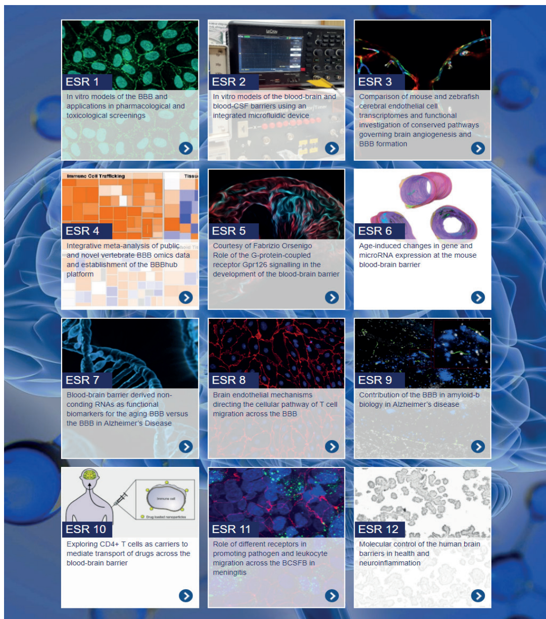
Figure 1: BtRAIN public website: Individual ESR projects, desktop layout

The non-academic partners brought the ESRs' education to perfection by providing additional trainings in industrial strategies, product innovation, career development and science communication. Via BtRAIN, ESRs got in contact with start-up companies, SMEs and 'big pharma' offering specific secondments.